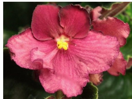
Burnt Autumn (P. Sorano) Reg# 10825 4/27/2016

Feel free to contact me by phone or email.